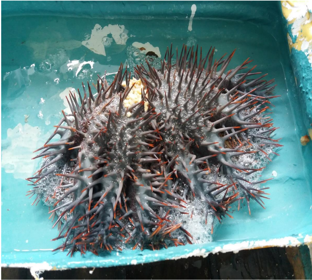
Crown of thorns starfish soaked in Vinegar for guest viewing